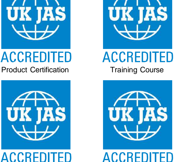
ACCREDITED Calibration Laboratory